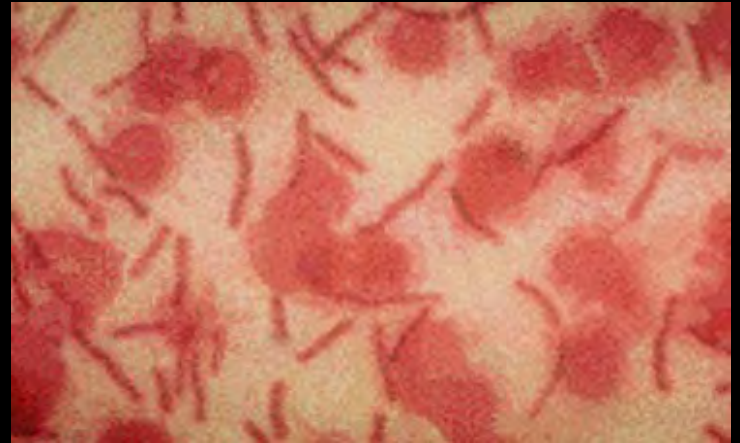
Picture of anthrax spores